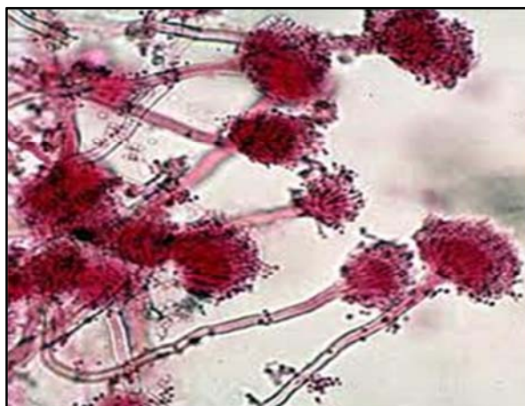
Figure 3. Shows Penicillium notatum under the microscope.

We found 6 types of fungi as followed in table: