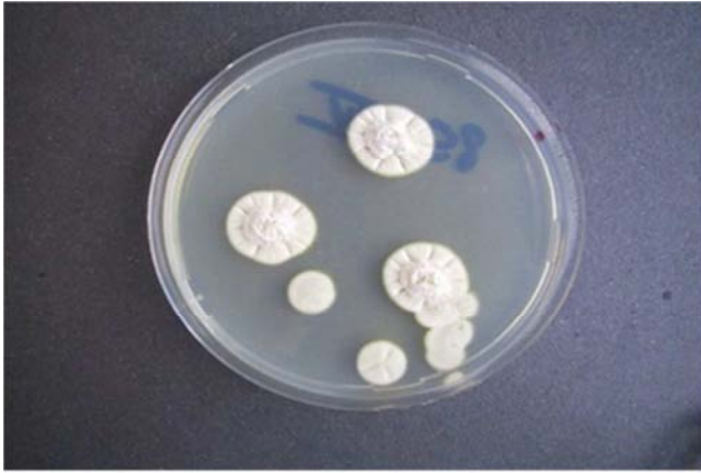
Figure 5. Shows Penicillium egyptiacum .