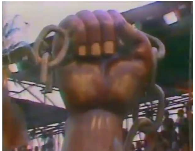
Figure 2. Sculpture of one of the floats from Unidos do Peruche. Samba-enredo: "Children of the Black Mother" (1988).

It is also clear that there are other shackles, the prejudice and social exclusion against men and women of color that affect successive generations. Regardless, in their cultural representations they sought to insert themselves in different ways in Brazilian society, whether in profane parties such as Carnival or in those of religious matrix. In this sense, the samba performers continued to seek protection from their orishas and Catholic saints, such as Our Lady of the Rosary, among other saints, to ensure the path of the following generations with less exclusion and more peace, "love" and "happiness" because she "has no color".